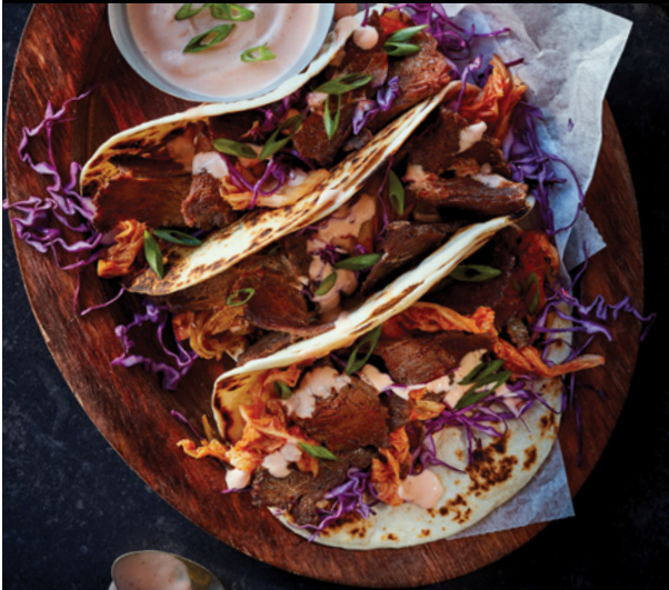
Korean Tacos – Korean Beef Barbeque, tortilla, kimchi, scallions, cilantro, purple cabbage, sriracha aioli

Discover our many on-trend global flavors by calling your Hormel Foodservice Representative or visit hormelfoodservice.com .