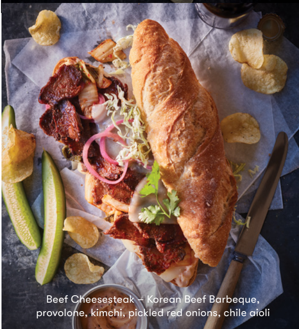
Beef Cheesesteak – Korean Beef Barbeque, provolone, kimchi, pickled red onions, chile aioli